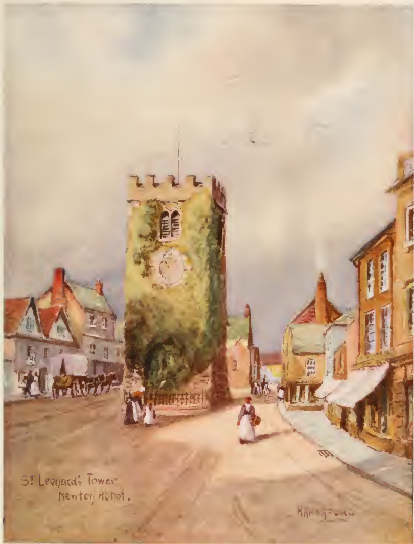
St. Leonard's Tower Newton, Hertford.